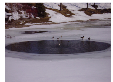
W I N T E R operations