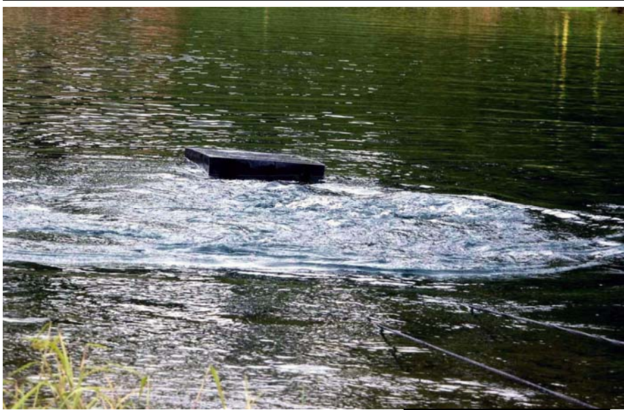
3400CF Water Circulator Creates Directional Flow and Water Movement